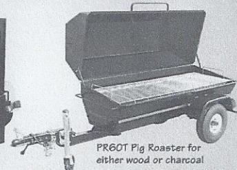
PR60T Pig Roaster for either wood or charcoal